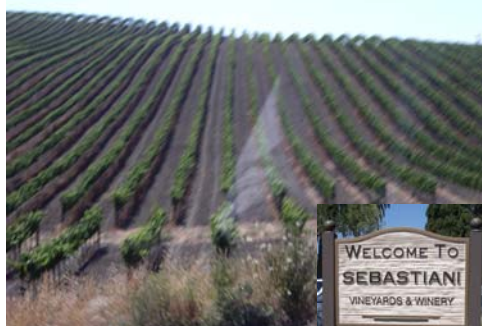
Outside my coach window