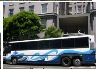
Coach at our door