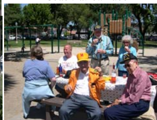
Table for 6, children at play