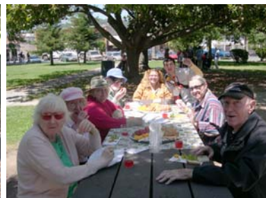
Table for 8 with or without sun