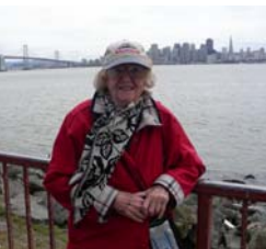
lyn is an actress as well.