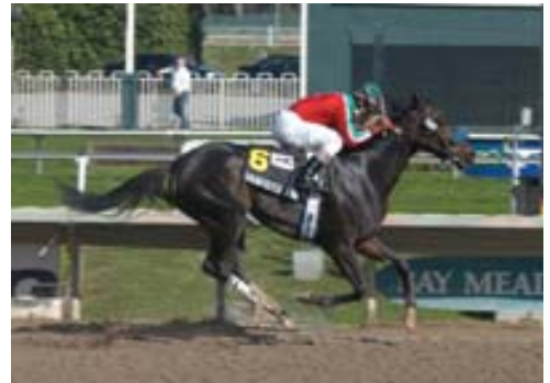
Not the Kentucky Derby but you may see her there.