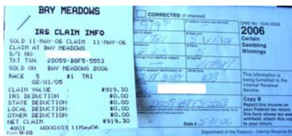
The IRS at the finish line.