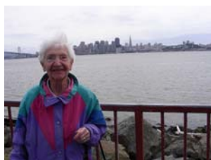
Gertie loves Treasure Island.