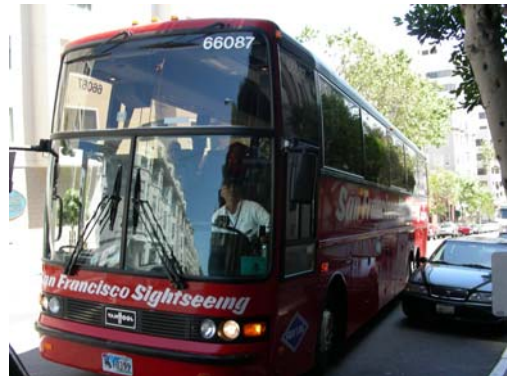
The Gray Lines tour bus was our starting gate.