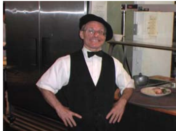
Garçon Bill serves avec joie

I'd like to go to Paris, but then there's all that traveling hence the idea, bring "a Night in Paris" to the Granada. Well for one night what would we do? What do you need? A beautiful dining room, a couple of cabaret performers, some candlelight, fine food and wine and let the evening take care of itself, and that's what we did that special night.