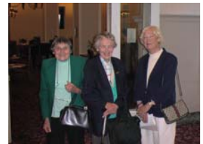
Good night ladies!