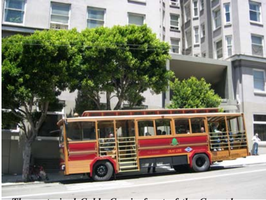
The motorized Cable Car in front of the Granada awaiting our "happy travelers."