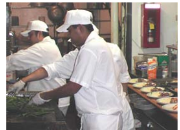
200 - salmon - beef - chicken entres